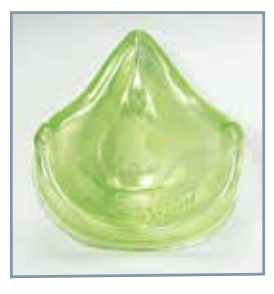
Hygiene Guard storage cap keeps respirator clean and prevents damage to the facepiece storage.