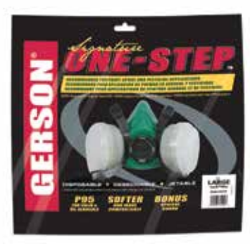
Reusable Foil Storage Bag plus individually wrapped respirator help assure best respirator life.