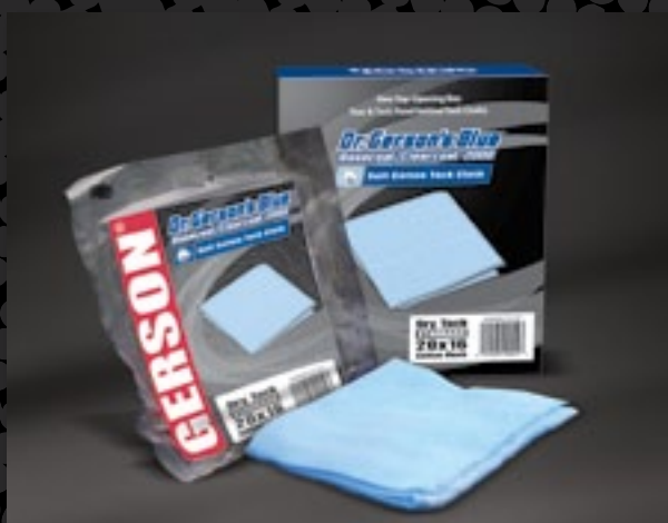
#020002B - Dry Tack 18" x 36" (12/box)