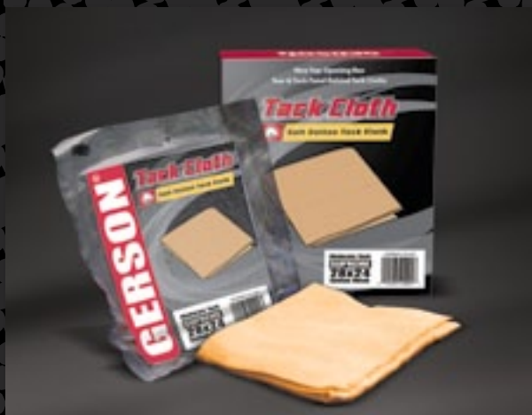
#020004G Moderate Tack 18" x 36" (12/box)