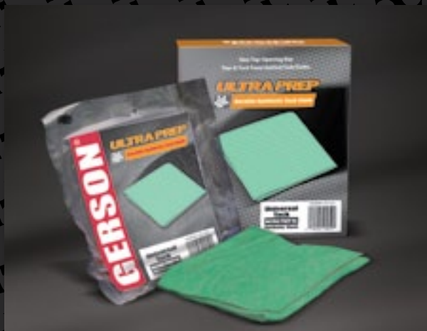
#020008G Universal Tack 18" x 18" (10/box)

Approved by leading Paint, Auto, Marine, Aerospace and Electronics manufacturers